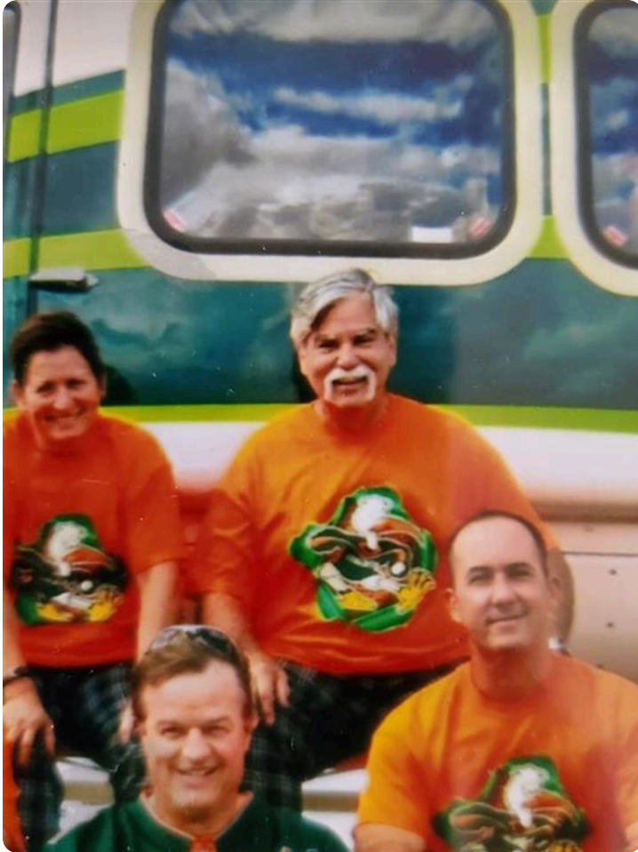
Kindest person I knew Loving Soul